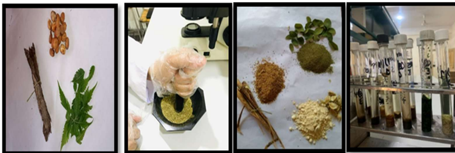
Fig 1: Collection, grinding, and extraction of Azadirachta indica , Moringa oleifera , and Citrullus colocynthis plant samples for antibacterial analysis against Corynebacterium pseudotuberculosis .

The antibacterial activity of the plant extracts was determined using both the agar well diffusion and disc diffusion methods as described by Mani et al. (2022), with minor modifications.