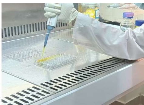
Fig 2: Determination of minimum inhibitory concentration (MIC) of plant extracts against C. pseudotuberculosis using the broth microdilution method in a 96-well microtiter plate.