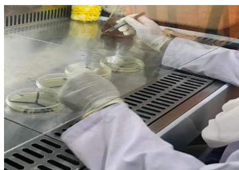
Fig 3: Antibiotic susceptibility testing of C. pseudotuberculosis using the Kirby-Bauer disc diffusion method with oxacillin, amoxicillin, and gentamicin discs on Mueller–Hinton agar.

Antibiotic susceptibility of C. pseudotuberculosis was assessed using the Kirby Bauer disc diffusion method according to Clinical and Laboratory Standards Institute (CLSI, 2015) guidelines (Abebe et al. 2015). Antibiotic discs including oxacillin (1 \mu g/mL), amoxicillin (25 \mu g/mL) and gentamicin (10 \mu g/mL) were placed on plates as shown in (Fig 3.). Plates were incubated at 37°C for 24 hours, and zones of inhibition were measured to determine resistance patterns.