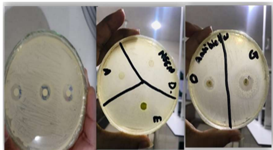
Fig 5: Anti-bacterial tests of A. indica , M. oleifera , and antibiotics showing less or no zones of inhibition.

The disc diffusion assay further confirmed that aqueous extracts of A. indica and M. oleifera exhibited the most potent antibacterial activity, particularly in leaf and seed extracts (Sandhu et al. 2014). Solvent-dependent variations were observed, as some ethanol and acetone extracts displayed negligible inhibition zones (Fig 5).